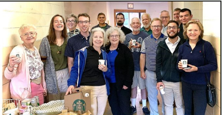
WELCOME SUMMER GRADUATE STUDENTS FROM THE FRANCISCAN CATHOLIC UNIVERSITY OF STEUBENVILLE, OHIO

JOIN US FOR COFFEE AND PASTRIES EVERY WEDNESDAY AFTER THE 6:30AM MASS AT ST. JOSEPH VESTIBULE