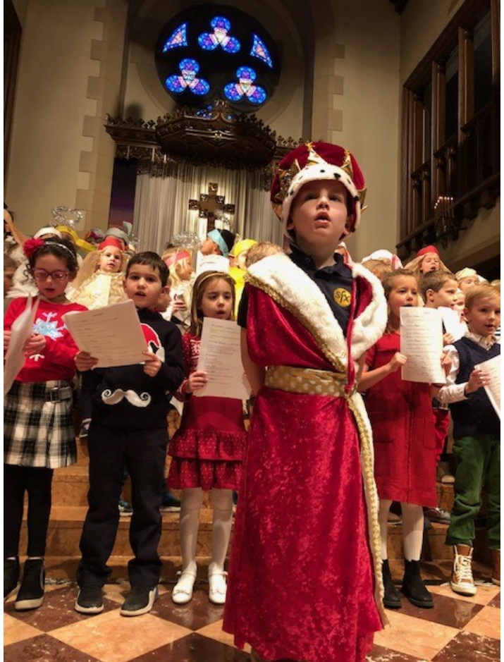
SFX Early Childhood Christmas Program

The feast is a celebration of Mary's motherhood of Jesus. On this day, we are reminded of the role that the Blessed Virgin played in the plan of our salvation. Through the Holy Spirit, God the Father prepared Mary to be the dwelling place where His Son and His Spirit could dwell among men. Christ's birth was made possible by Mary's fiat, or sanctioning of God's plan with her words, "Be it done to me according to thy word." Calling Mary "Mother of God" is the highest honor we can give to her. Just as Christmas honors Jesus as the "Prince of Peace," the solemnity of Mary, Mother of God honors Mary as the "Queen of Peace."