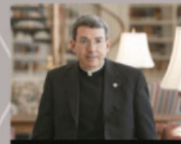
Parish Center at Sacred Heart